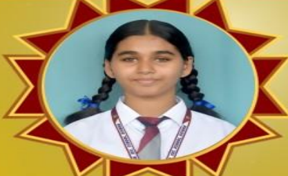
HEER AILANI RANK 1st