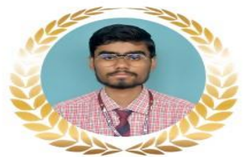
ASIM RANK 3rd

Hardworking students like you always perform successfully in their exams.